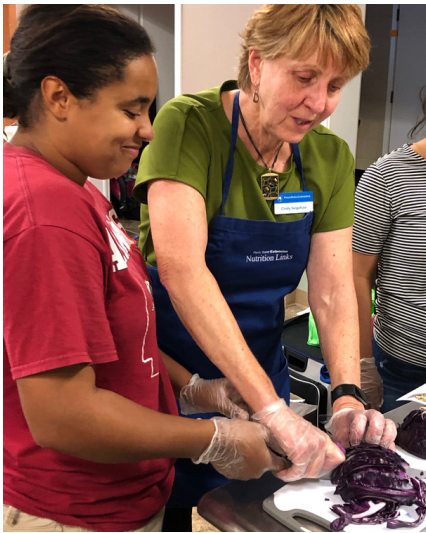
..... Cooking & Nutrition Series