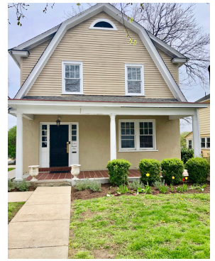
..... New Home