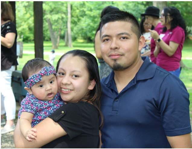
Family Picnic .....