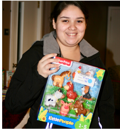
..... Christmas Shopping Event