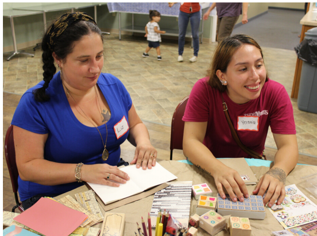
..... Mentor Pair Workshops