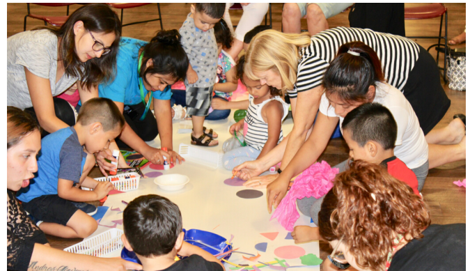
..... Monthly Club Nights