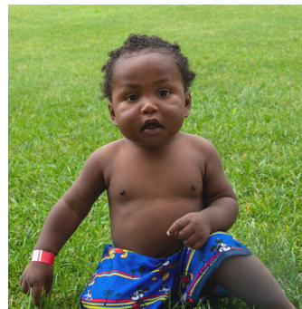
Summer Pool Party